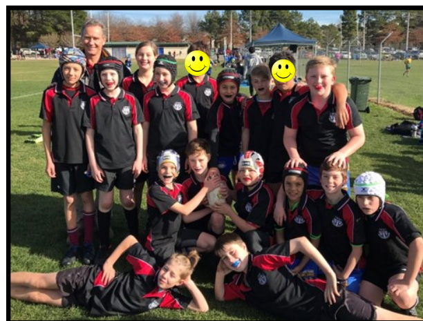
The Sullivan Shield Rugby League Team